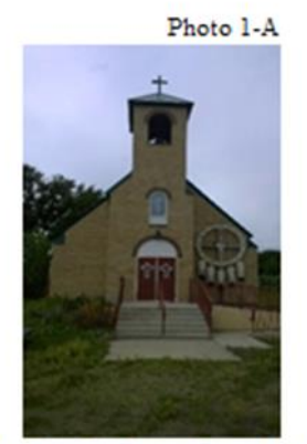
Holy Family Mission (circa 2014)

HFMS following suit in 1888 just outside of Browning, Montana (Black, 2014). The school remained active until closing its doors in 1940 due to increasing financial difficulties.<sup>12</sup> Today, a historical marker situated at the site of the HFMS whitewashes the reality of the deculturization that occurred from fifty years of Catholic education. The signs references the HFMS as 'the first institution on the