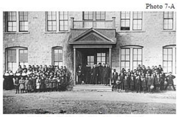
Holy Family Mission School - circa 1901

The priests and nuns traveled by wagon into the encampments collecting students' to attend school. The children and mother's ran from the wagons crying, but if families refused to send their children away the agent cut off their rations (BF05). The starvation