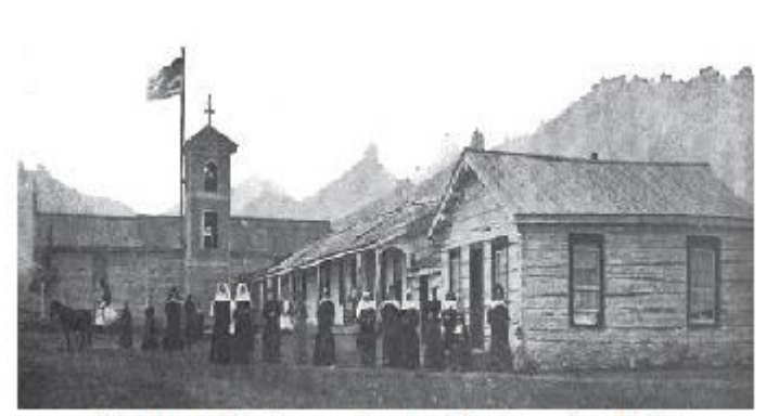
Saint Peter's Mission near Cascade, Montana - circa 1897

(Annual Reports of the Commissioner of Indian Affairs, 1901, p. 9).