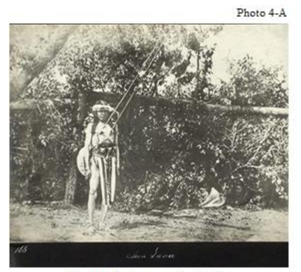
Blackfeet Sundancer - circa 1910

watched reverently and exclaimed over his degree of pain and bravery. The man danced